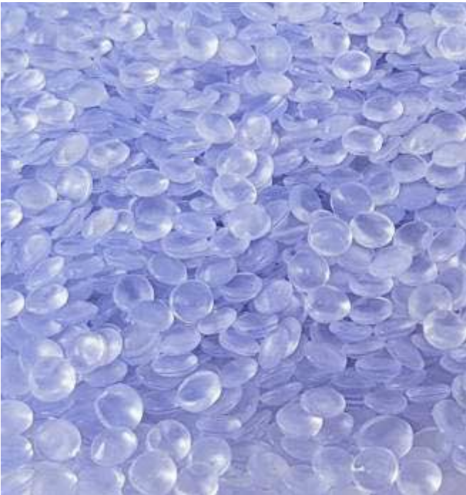
Bio compatibility test report of PVC medical compound